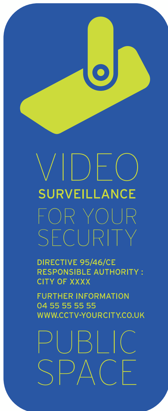
Panel type Camera