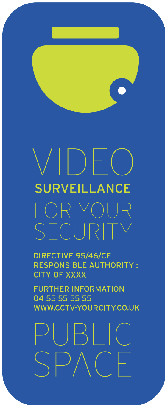
Panel type Dome